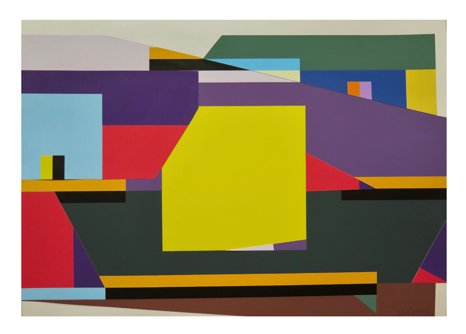
Situation I., 2020 paper collage 50 x 70 cm