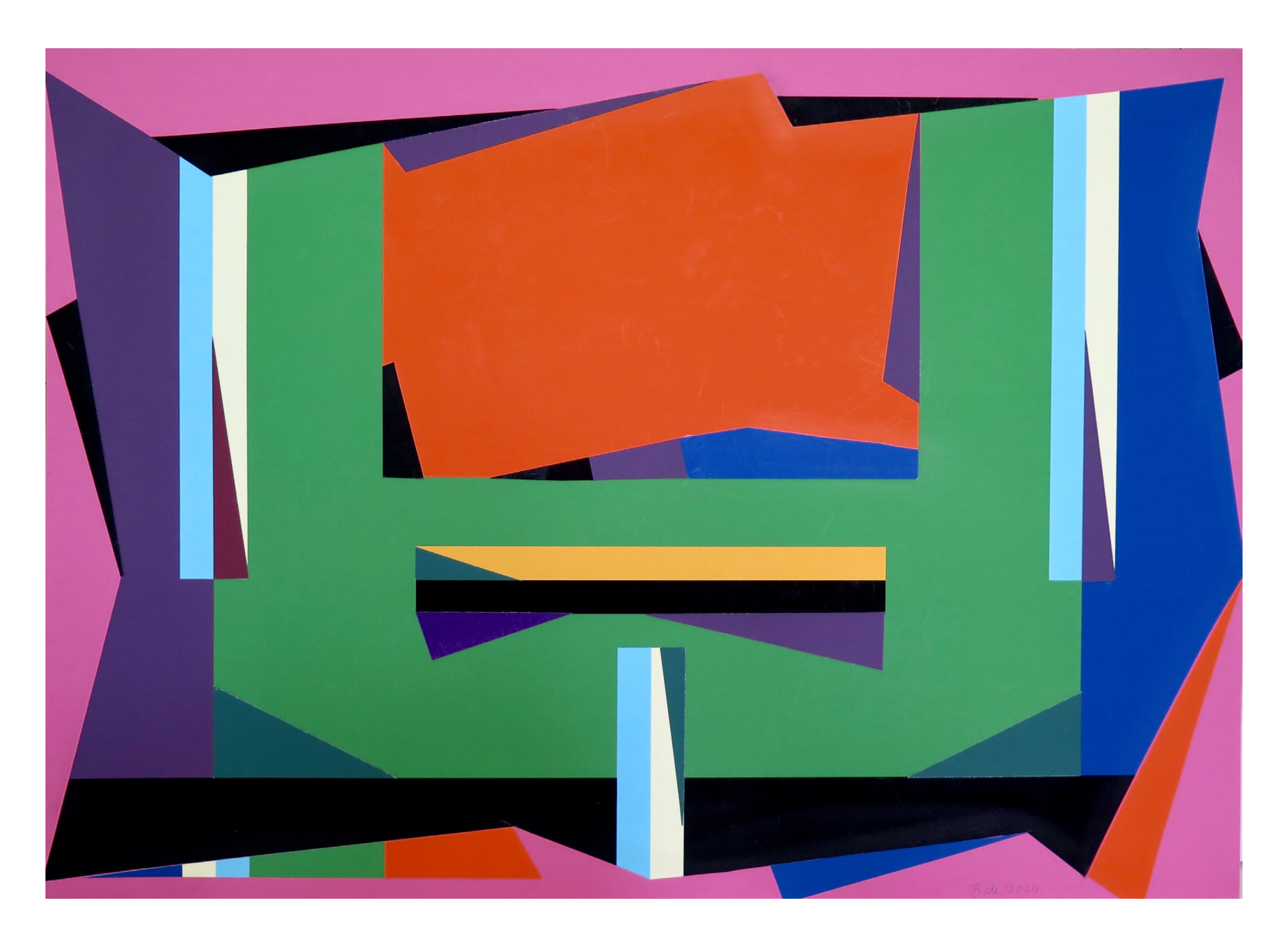
Situation VI., 2020 paper collage 50 x 70 cm