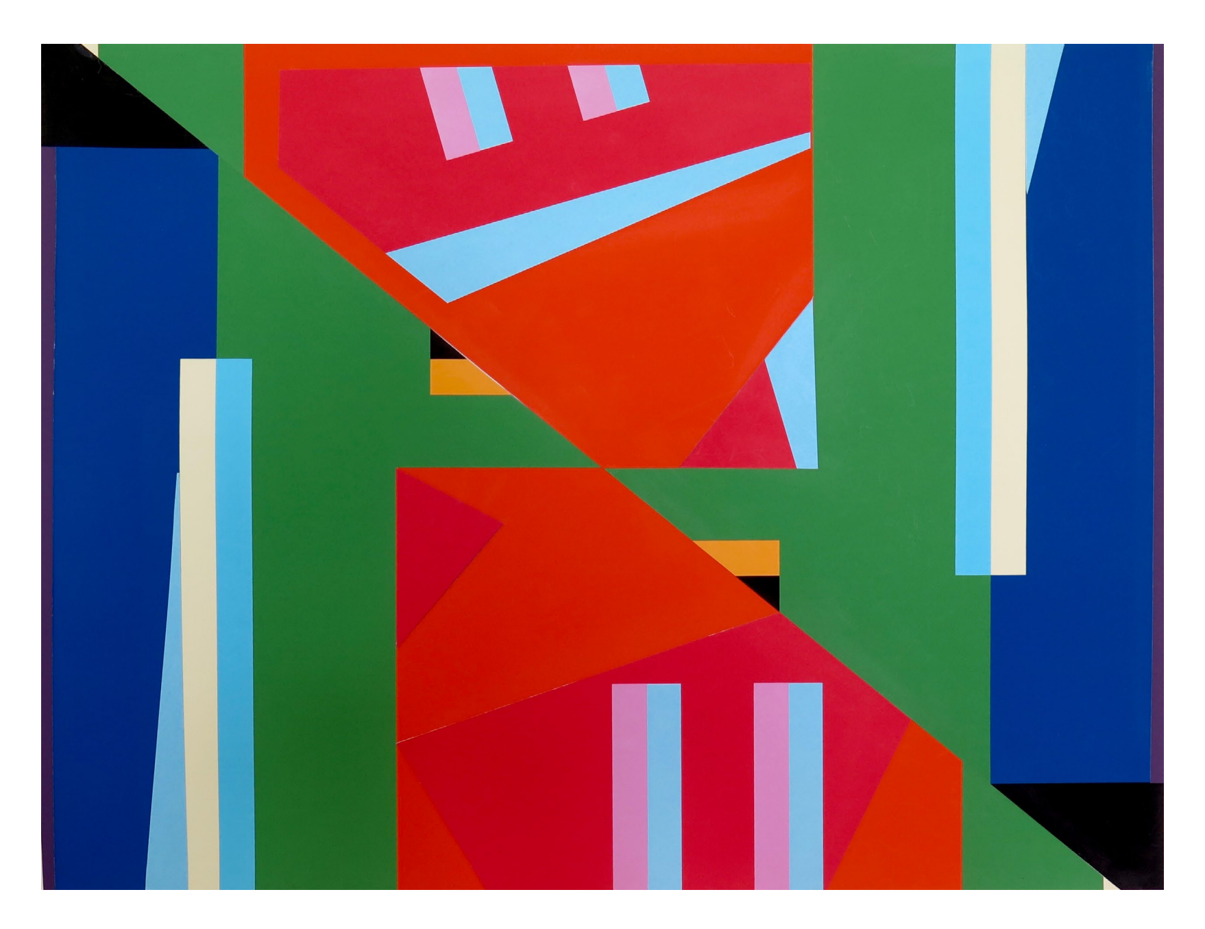
Situation IX., 2020 paper collage 50 x 70 cm