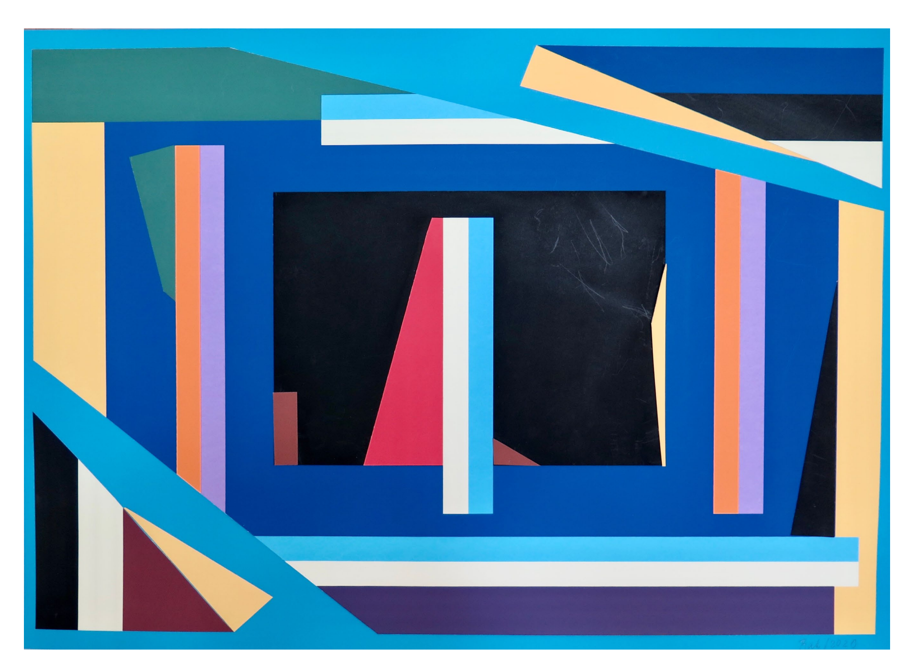
Situation III., 2020 paper collage 50 x 70 cm