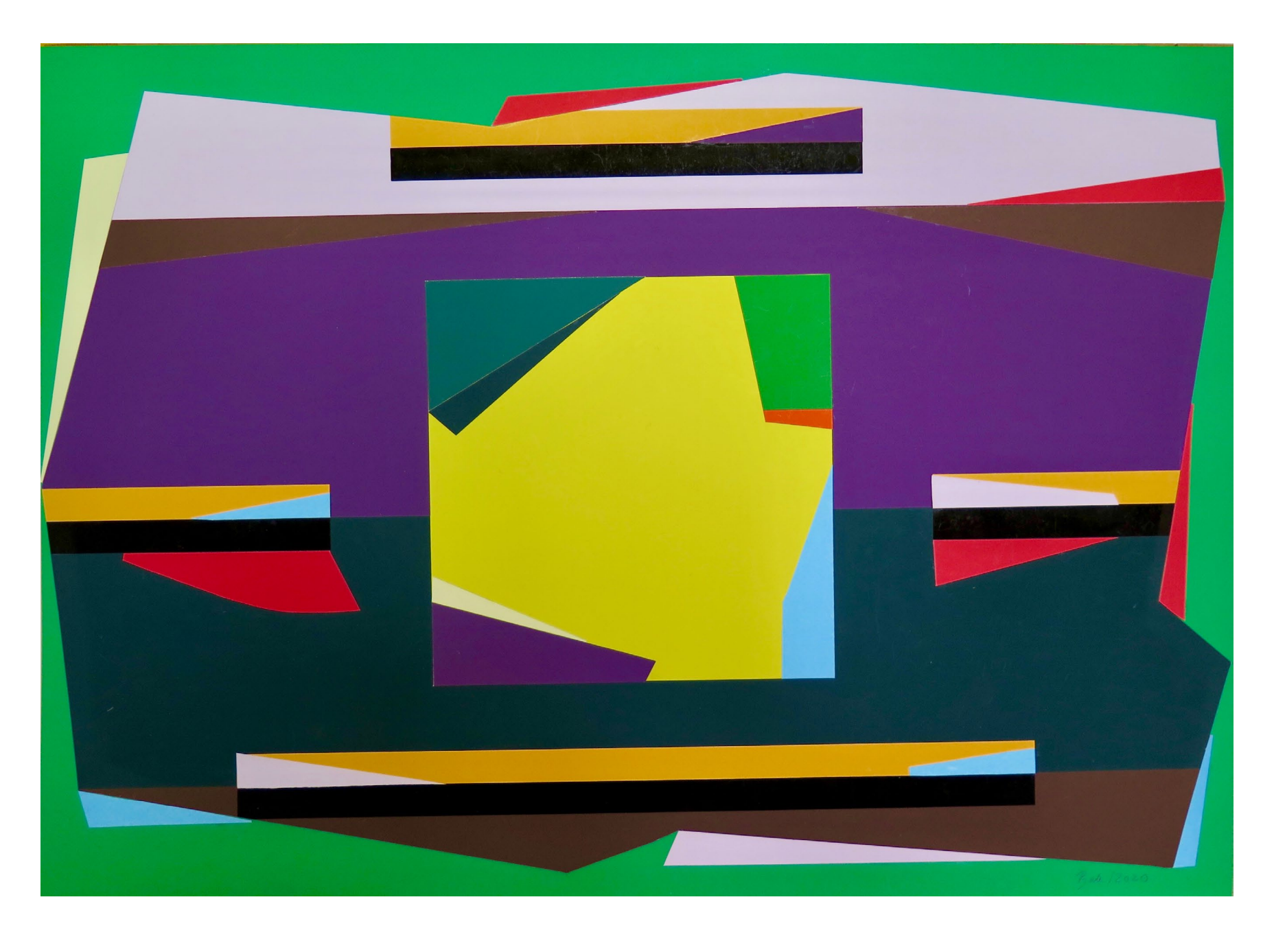
Situation V., 2020 paper collage 50 x 70 cm